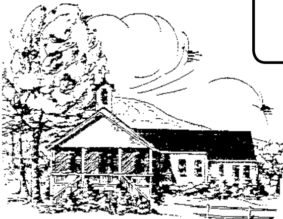
Celebrating 100 years 1910-2010