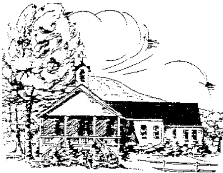
Celebrating 100 years 1910-2010